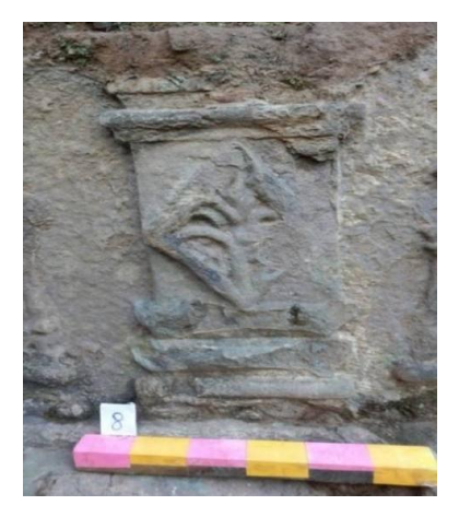
Figure 8: Naga Pushpa, a flower motif mostly used in Hinduism to protect Shiva lingum. Mahisasuramardini (Fig. 9)

This relief shows the Naga Pushpa flower in relief. According to Hindu mythology the flower was given a name of Naga Lingam. The trees of these flowers are abundantly planted in the Shiva temple all over India. The tree is called Shiv Kamal in the local Hindi language and also famous as "Kailaspati". The Tamil people called it Nagalingam in local language. The flowers of this tree are called Shivalinga in Hindi, Nagalinga Pushpa in Kannada, Nagamalli or Mallikarjuna flowers in Telugu. In Hinduism the tree is sacred as the petals of the flower has close resemblance to the hood of the Naga (Serpent). Naga is a sacred snake responsible to protect and safeguard a Shiva Lingam.