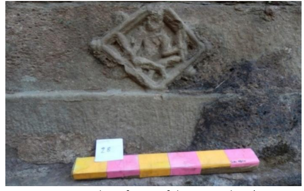
Figure 14:Dinvarpala: A figure of door Guardian

Dvarapala in Sanskrit is used for a door or gate guardian generally depicted as warrior or fearsome asura giant. It usually decorated with a weapon. The most common weapon is gadha mace. The depiction of Dvarapala image is very common architectural feature of Hindu and Buddhist art India as well as in the other areas influenced by them. In the present relief drvapala in siting in cross legs holding weapons in his both hands, prominent eyes in a slim body.