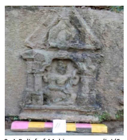
Figure 9: A Relief of Mahisasura mardini

This relief show a Mahisasuramardini sitting on a high throne in the center of the Kashmiri style nitch. The multi-armed Durga, crushes the buffalo with her raised powerful legs. She also plunges her trident in the human form of the demon Mahisha which is most probably emerging from the neck of the wild beast. The vehicle of this deity is a lion which joins the fight mauling the buffalo from backside. In this popular relief of Durga which is highly honored by garland-bearing of celestial attendants (gandharvas)