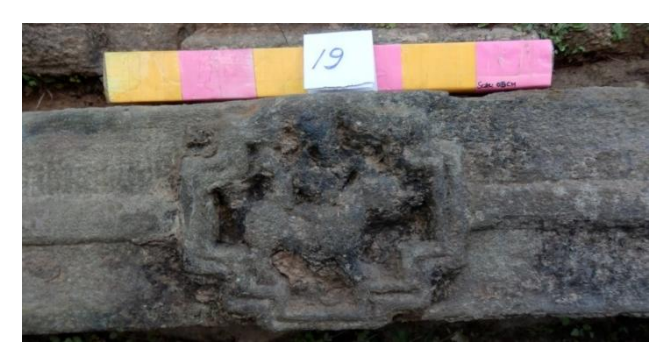
Figure 11: Relief of Durga riding on its Vahana , (Source: TIAC)

In this relief only a lion, the Vahana of Durga is clearly shown. As it is defaced therefore its attributes even her arms cannot be described. It is an important deity of Shivaite cult, and its position is depicted entirely under the relief of Mahisasuramardini which is the part of main unit or upper pier.