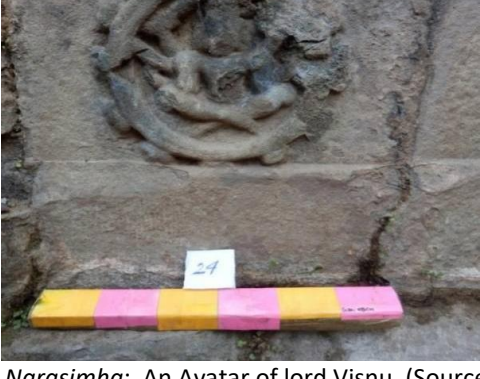
Figure 13: Narasimha: An Avatar of lord Visnu, (Source: TIAC)

In this relief Narasimha is shown as yogic form with six hands approximately. Left hand side of deity is partially mutilated but a lion shape head emerges from the round panel of the relief. There is no demon (Hiranyakashipu) on the thigh of Narasimha and its part is dilapidated condition. In Kashmir all the Avatars of Visnu were quite important in ancient times. As in Avantishwami temple, Narasimha was carved as relief and the style of carving is quite different from that of Bihal Baoli . Horse riding was carved out in several Hindu Temples and in Kashmir, Narrative scenes of horse riding were very common even in modern period. The theme of horse riding is mostly used in Kashmir wood carvings also.