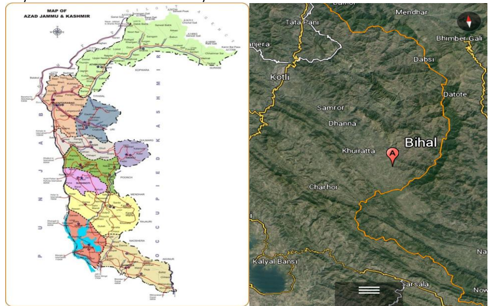
Figure 1, Location Map of Bihal, Kotli

Bihal Baoli is located 33.21'32 N to 74.2'58 E, in a small village of Bihal situated in Khuiratta town. The distance of Bihal village from Khuiratta town is about 4 Km. in east direction (Fig.1). The distance of the village from Kotli district is about 29 km in southeast direction and 165 Km from Islamabad. The village is 7 Km. from the Line of Control and located on the western side of Rajouri sector (Indian occupied Kashmir), with Charhoi to the west, Rajouri to the east, Noushera (IHK) to the south. Nakyal to the northeast and Kotli city to the northwest direction.