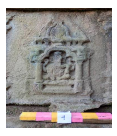
Fig 6: Ganesha with its attributes but inmutilated condition

All symbolism discussed above are clearly shown in this figurative relief were Ganesha deity having elephant headed with big belly but belly is mutilated here and most probably seem to be flat. The deity has four hands with holding their respective attributes. But all the attributes are not completely recognizable due to the dilapidated condition. Padma pitha or pedestal of Ganesha is clear. The color of Ganesha observed here is partial yellow and red, which can be seen in most parts of Kashmir and India.