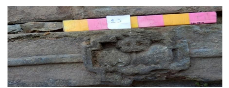
Figure 12: Garuda within the panel of mandala in middle cornice, (Source: TIAC

In Bihal baoli , Garuda is separately depicted which shows the popularity of Garuda in ancient Kashmir. The condition of this relief is best among all the previous discussed panels. Face of bird is more prominent while other physical parts were not carved. Over the head, hairs of Garuda were carved prominently.