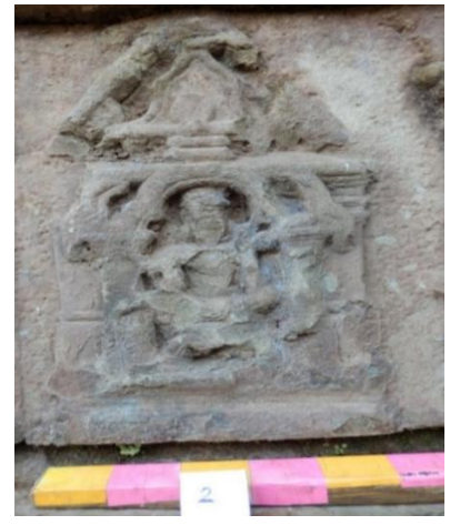
Figure 4: Shiva deity with its attributes in dilapidated condition. Peacock or Swan (Fig.5)

The main iconographic features of god Shiva are his third eye on the center of his forehead, the snake Vasuki all around his neck, the white beautiful crescent moon, the transparent water of sacred holy river. The water of holy river of Ganga is beautifully flowing from his knotted hair. The trishula is the popular weapon and damaru is a musical instrument of lord Shiva. In Hindu cult the Shiva is generally worshiped in the aniconic form of Shive Lingam. There is no doubt that Saiva as a popular deity was widely worshipped in the Kashmir valley from ancient times (Ray, 1969, p. 168). Early sculptural representations of god Shiva, which have been still survived are seated figure of Lakulisa, a form of Shiva at Pandrethan. Several sculptural reliefs of god Shiva at the temple of Payar having lord Shiva seated cross-legged on the throne under the canopy of an hanging tree and surmounted by votaries (ibid, p. 172). At the Behal baoli the figure is showing a mutilated condition of Shiva but its position in the northern wall can be recognized that is depicted by the side of peacock and Ganesha. According to Hindu mythology Ganesha is believed the son of lord Shiva. The Parvati is the mother of Ganesha. These two members of Shaivite family are popularly found in Kashmir as Shaivism is a popular cult worshipped by Kashmiris.