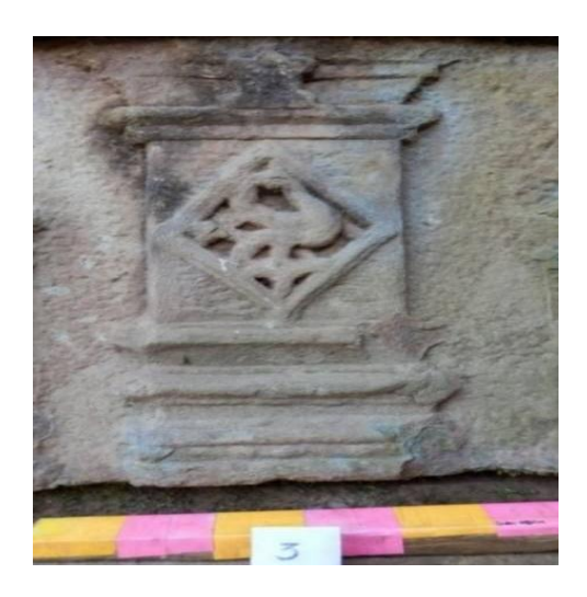
Figure 5: Peacock relief turning his head back holding piece of food in his beak and sitting on a branch of tree.

As discussed earlier Sarasvati is the famous river in the present India it is generally associated with consciousness which brighten up the process of creation in the world. Apart from this she is also consider the dawn-goddess and her brighten rays vanish the darkness of ignorance as well as backwardness from the world forever. Without her existence there will be chaos and confusion all over the world. If anybody to realize her existence in this world one must have to go beyond the happiness and comfort of the senses and also rejoice in the calmness of the soul. The sacred river Saraswati is usually associated with two vahanas - peacocks and swans.