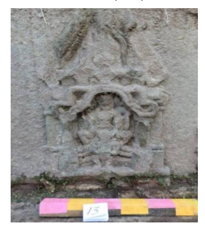
Figure 10:Detail of Vaikuntha Chaturmurti