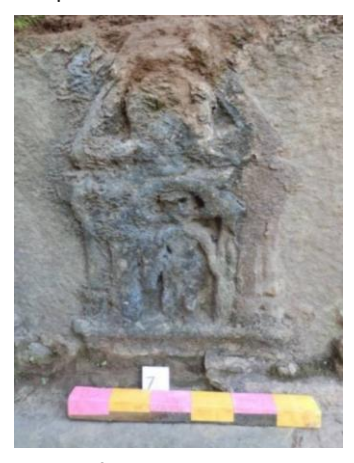
Figure 7: Standing deity of Visnu holding Gadadevi.

The well-known god Visnu which generally preserve the entire universe in Hindu mythology. Symbolically this popular god is associated with military power and wars therefore shankha (conch used to alert troops), gada ,(mace), and a chakra ,(sharpened small wheel used as a weapon) are ichnographically represented. The Vishnu god is the central character of the two popular epics stories of Hinduism Mahabharata and Ramayana . The lord Vishnu in Hindu mythology has many forms, therefore he is usually depicted as a powerful god or as one of his ten incarnations ( Avataras ). Such Avatars are existed on earth. One of most popular incarnation of Vishnu is Krishna, which is very common in Hindu art. It is widely worshiped in all over India.